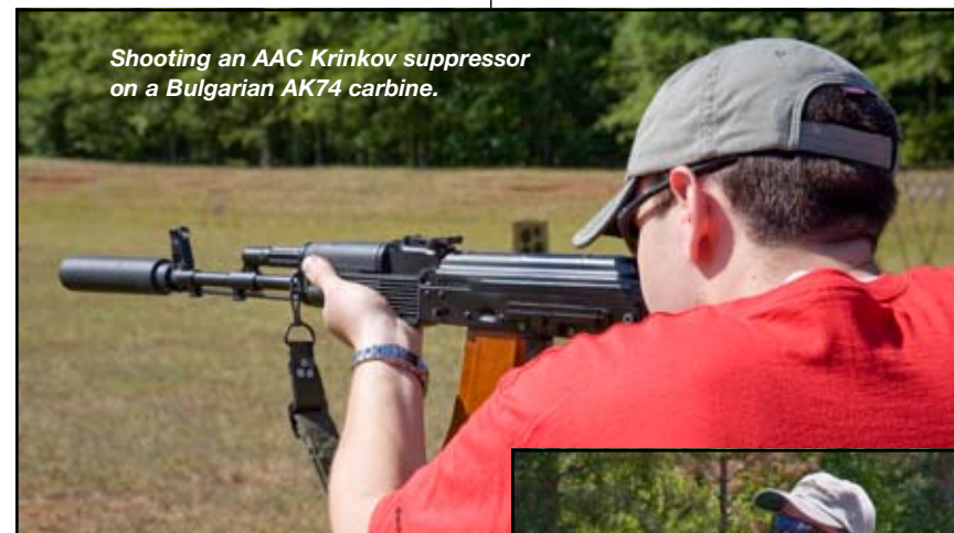
Shooting an AAC Krinkov suppressor on a Bulgarian AK74 carbine.

SWR brought a host of pistol, submachine gun, and rifle suppressors for people to try. Since 1994, SWR has held a nearly cult following of satisfied customers. One of the most popular boutique silencer manufacturers in