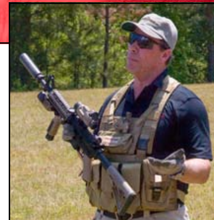
SureFire demos their M4FA556-BK quick-detach 5.56mm suppressor.