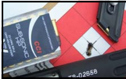
After setting point of aim/point of impact at 10 yards with the CTC Lasergrip, author fired three rounds into this tight cluster at this distance with the suppressor installed.

For my purposes, when I finally obtain my own AAC Pilot it'll be used