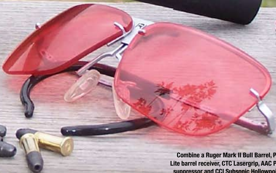
Combine a Ruger Mark II Bull Barrel, Pac-Lite barrel receiver, CTC Lasergrip, AAC Pilot suppressor and CCI Subsonic Hollowpoints with a safe backstop for some fun.