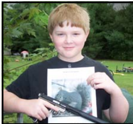
Author's son enjoyed working on a squirrel target with Project Snuffy off the back deck.

interchangeably on Snuffy and a Ruger 10/22 that I plan to also equip with a Tactical Solutions threaded barrel.